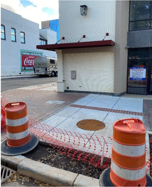
Sculpture site at Barbrick Ave & Union Street in Downtown Concord, NC. (Footer is beneath orange manhole cover)