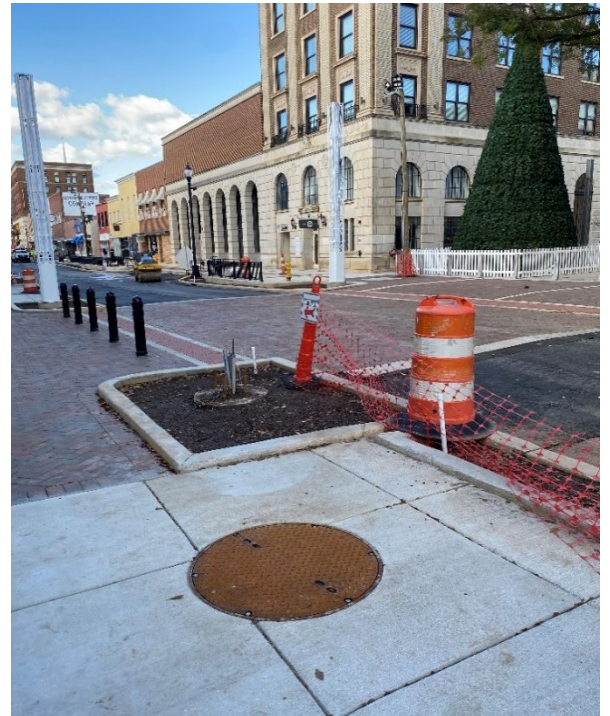
Sculpture site at Cabarrus Ave (South of intersection) on Union Street in Downtown Concord, NC. (within planting bed)